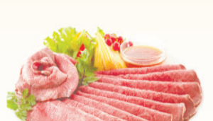
Kretschmar Roast Beef