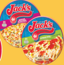
Jack's Pizza 15-18.9 oz Package