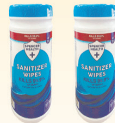
Spencer Health Sanitizer Wipes 80 Count