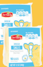
Our Family American Cheese Singles 12 oz 16 Count Slices