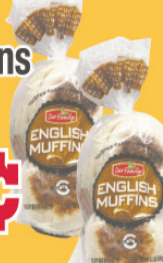
Our Family English Muffins 12 oz Package