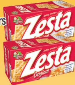
Keebler Zesta Saltines Crackers 16 oz Package