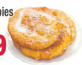
Bakery Fresh Cinnamon Crispies 3 Count