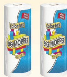
Colortex Big Mopper Paper Towels 1 Count Roll