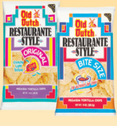
Old Dutch Restaurant Style Chips 10-13 oz Bag