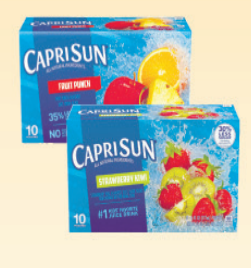
Capri Sun Juice Boxes 10 Count