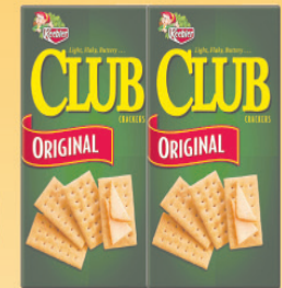
Keebler Club Crackers 11-13.7 oz Box