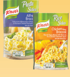
Knorr Rice & Pasta Noodles 3.8-5.9 oz Package