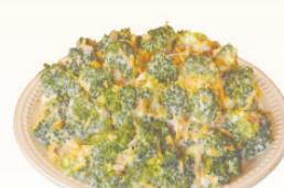
Deli Fresh Broccoli Salad