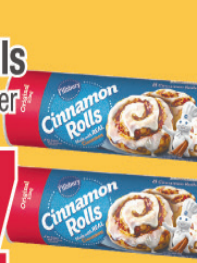
Pillsbury Cinnamon Rolls 12.4-13.9 oz Canister