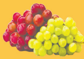
Red or Green Grapes