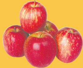
Bulk Honeycrisp Apples