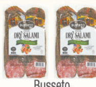
Busseto Italian Dry Salami Herb & Spices 8 oz Package