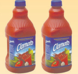
Clamato Tomato Cocktail 64 oz Bottle