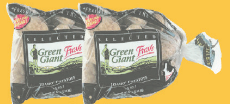
Green Giant Potatoes 5 lb Bag