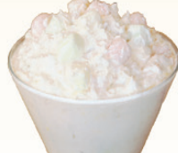
Deli Fresh Hawaiian Ambrosia