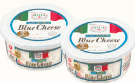
Stella Cheese Crumbles Assorted Varieties • 5 oz Tub