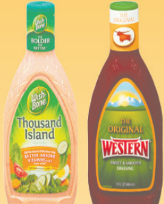
Wishbone or Western Dressing 15 oz Bottle