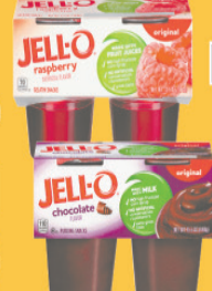
Jell-O Cups 12.5-15.5 oz Package