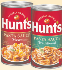
Hunt's Spaghetti Sauce 24 oz Can