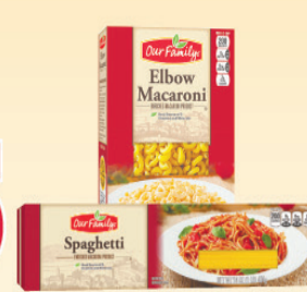
Our Family Noodles 12-16 oz Package