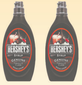
Hershey's Syrup 24 oz Bottle