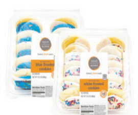
Open Acres Frosted Cookies 10 Count