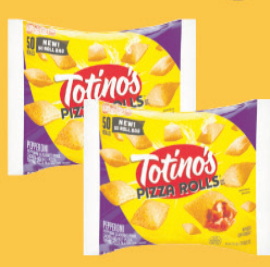
Totino's Pizza Rolls 50 Count