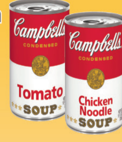
Campbell's Tomato or Chicken Noodle Soup 10.75 oz Can