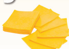
Deli Fresh Cheddar Cheese