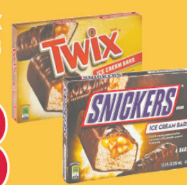
Snickers or Twix Ice Cream Bars 8 Count