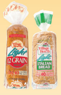
Village Hearth Light Wheat, 12 Grain or Italian Sesame 16 oz Loaf