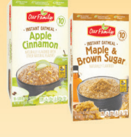
Our Family Instant Oatmeal 8 Count Box