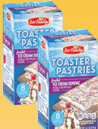
Our Family Ice Cream Sundae Toaster Pastries 14.7 oz Package