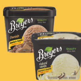
Breyers Ice Cream 1.5 Quart