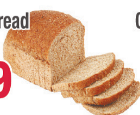
Bakery Fresh Cracked Wheat Bread 1 lb Loaf