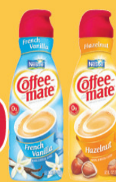
Coffee-Mate Creamers 32 oz Bottle