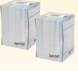
Super Soft Facial Tissue 80 Count Box