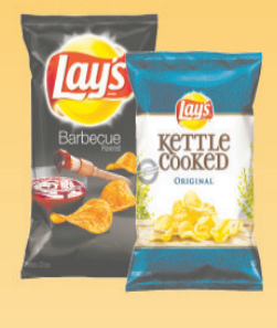
Lay's or Kettle Potato Chips 10 oz Bag