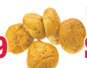
Bakery Fresh Onion Buns 6 Count