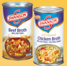
Swanson's Broth 14.5 oz Can