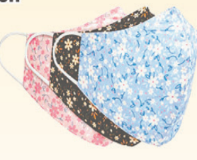
Adult Fabric Fashion Face Masks 3 Count