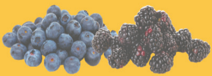
Fresh Blueberries 1 Pint or Blackberries 6 oz Package