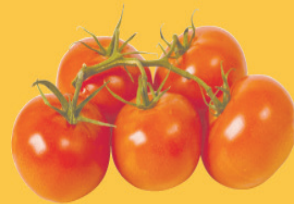
On the Vine Tomatoes