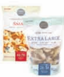
Open Acres Cooked Shrimp 61/70 Count • 16 Oz.