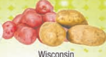
Wisconsin Red Potatoes Green Giant Russet Potatoes 5 Lb. Bag