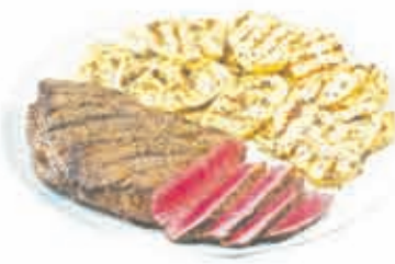
USDA Choice Boneless Beef Top Round Roast or Steak