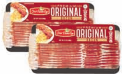
Our Family Sliced Bacon