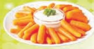
Fresh Peeled Baby Carrots 1 Lb. Bag