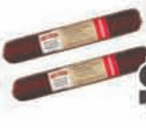
Old Wisconsin Summer Sausage 20 Oz. Package