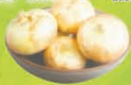
Sweet Vidalia Onions