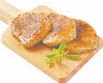
Lean & Tender Boneless Assorted Pork Chops