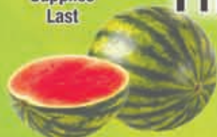
Seedless Whole Watermelon Each