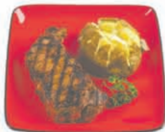
USDA Choice Boneless Beef New York Strip Steak