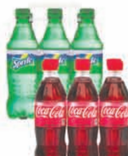
Coke Products 6 Pack .5 Liter Bottles