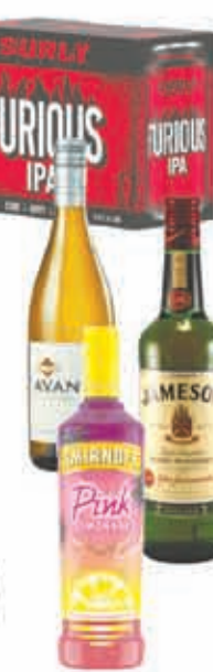
Surly Furious 12 Pack Cans