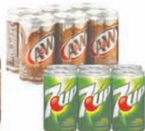
7-Up or A&W Products 6 Pack 7.5 Oz. Cans