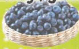
Fresh Plump Blueberries Pint