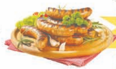
Brat of the Week Wild Rice