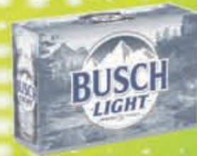
Busch Light Beer 24 Pack Cans Excludes Apple