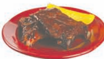
Today's Cut Baby Back Pork Ribs