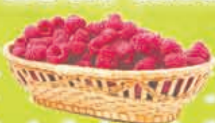
Fresh Sweet Raspberries 6 Oz. Container