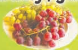
Seedless Green or Red Grapes