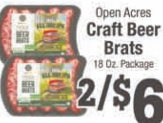
Open Acres Craft Beer Brats 18 Oz. Package