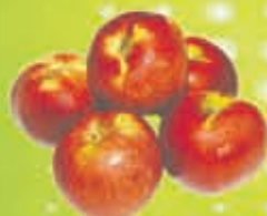
Washington Honeycrisp Apples