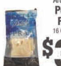
Arctic Spray Pollock Fillets 16 Oz. Package