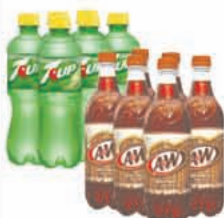
7-Up or A&W Products 6 Pack .5 Liter Bottles