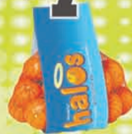
Halos Clementine Mandarins 3 Lb. Bag