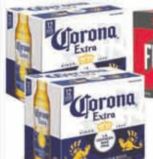
Corona Beer 12 Pack Bottles