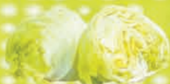
Fresh Head Lettuce Each