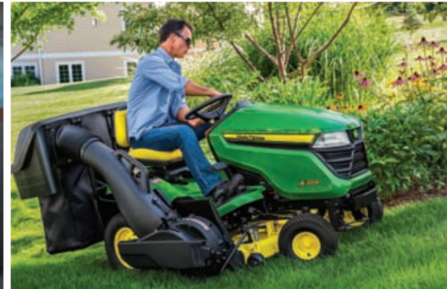
15% Off Bagging Systems & Mulch Kits

Order Parts Online | Apply for Financing | Browse Inventory | semaequip.com