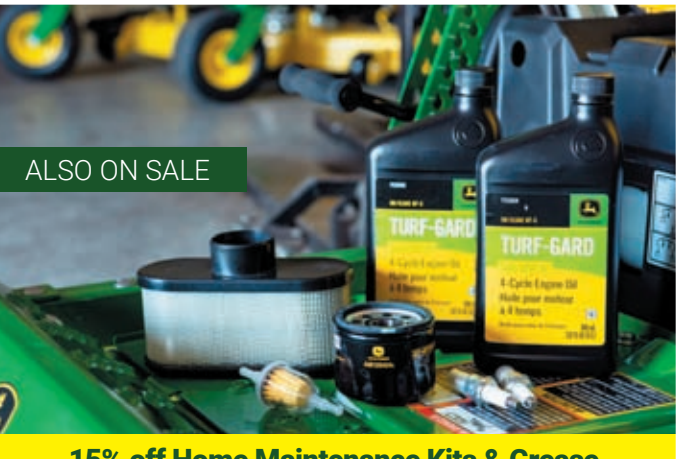
15% off Home Maintenance Kits & Grease

tional repairs. We will contact you prior to completing additional repairs