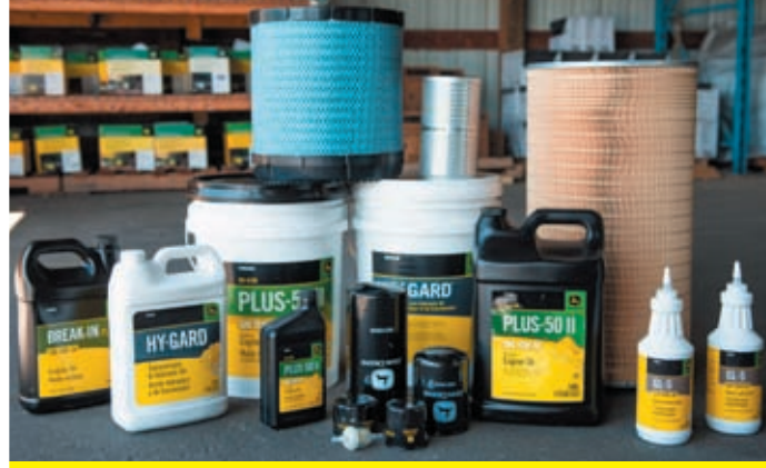
12% off John Deere Filters | 10% Off Packaged Oil